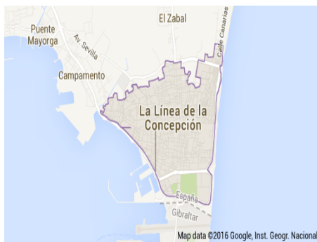
Satellite map of Línea de la Concepción, in Andalucía, from Google maps