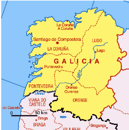
Provincial map of Galicia, where they appear the provinces of Ourense and Lugo