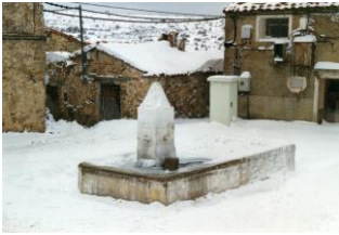
TORIL, YEAR 1998

My maternal grandparents are from Toril, a village in Teruel. They came to Barcelona in 1936 because in this year the Civil War started.